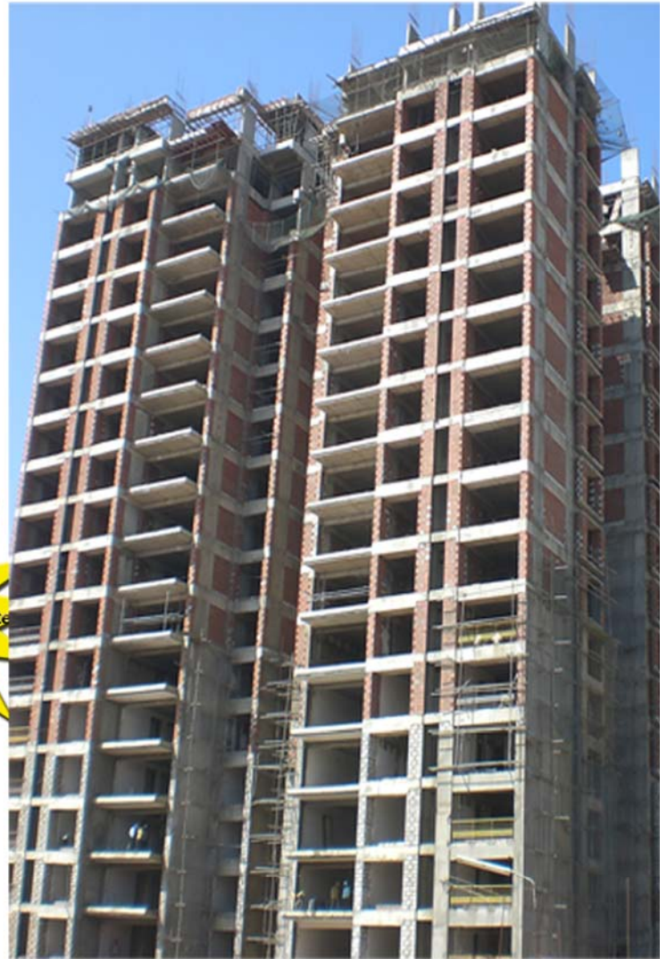
POROTHERM HP Bricks used in a 21 floor residential project.