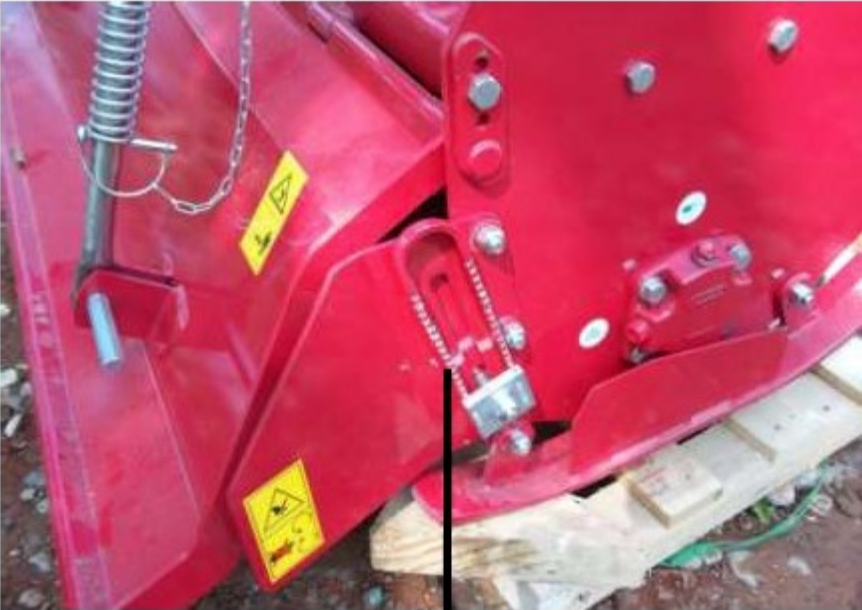
Multi depth Adjuster