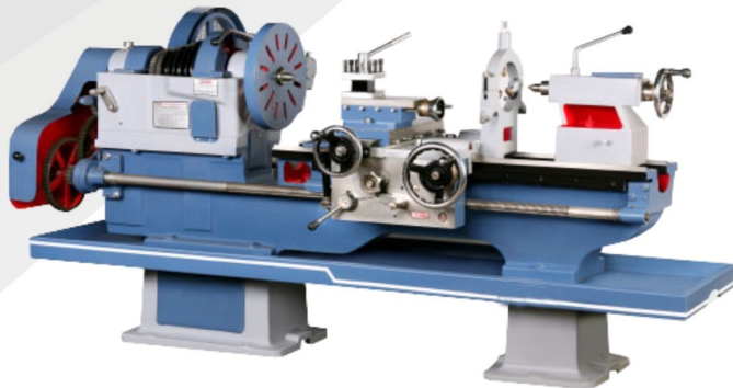
LATHE HEAVY DUTY MODEL No. 87

Note : Packing and Forwarding Cost Rs. 500/-