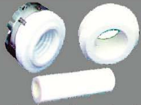
Mechanical seal with ceramic sleeve