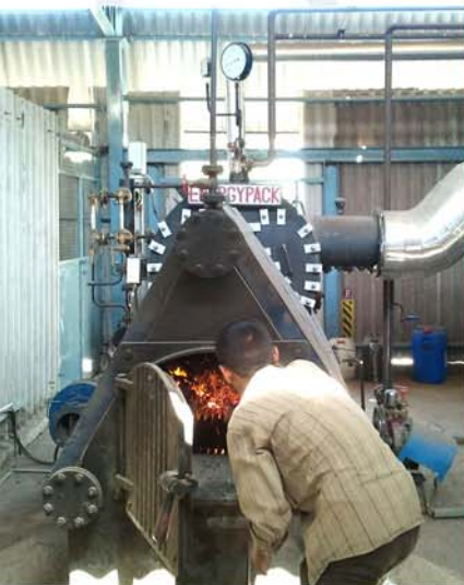
Solid Fired Membrane Type SIB Boiler