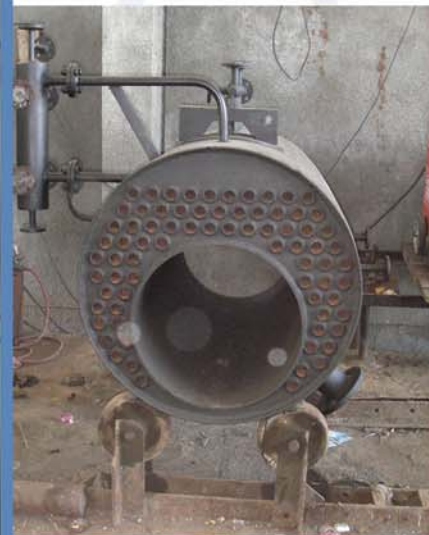
Oil / Gas Fired Horizontal Smoke Tube Boiler