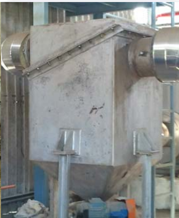
Multi Cyclone Dust Collector with Rotary Airlock Valve.