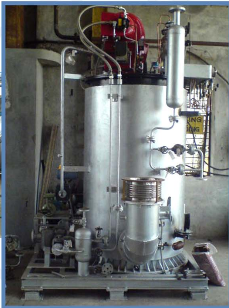
Oil / Gas Fired SIB Coil Type Boiler