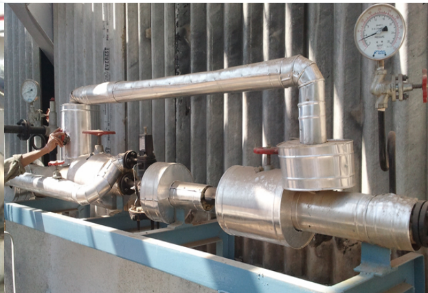
Pressure Reducing Station.