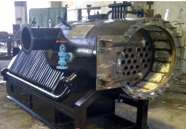
Membrane Wall SIB Boiler