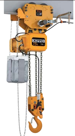
Large Capacity ER2SG Geared Trolley Type 7.5t to 20t