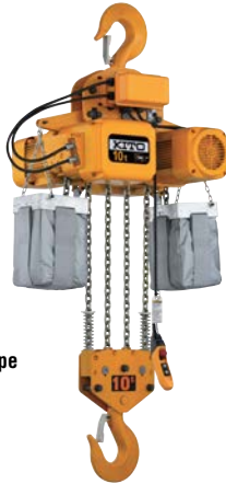
Large Capacity ER2 Hook Suspension Type 10t to 20t