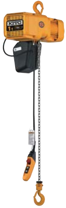
ER2 Dual/Single Speed Hook Suspension Type 125kg to 5t

Kito ER2 Series are key players in the Kito Electric Chain Hoists, featuring superior performance as a high quality, high performance crane with state-of-the-art specifications. Seeking improved ease of use and work efficiency, an inverter has been provided as standard in a dual speed hoist and trolley, never, reducing load swing.