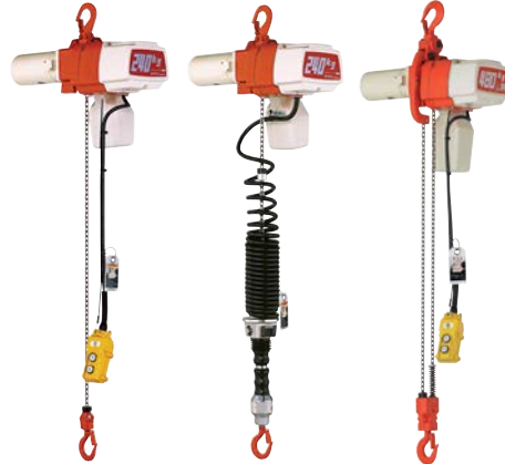
Single/Dual Speed 60kg to 240kg