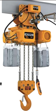
Large Capacity ER2M Motorized Trolley Type 7.5t to 20t