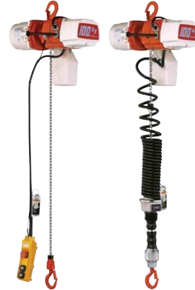
Single Speed 100kg