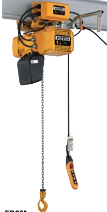
ER2M Dual/Single Speed Motorized Trolley Type 125kg to 5t