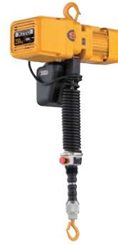
CDER2 Cylinder Control Type Dual/Single Speed 125kg and 250kg