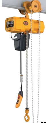
ER2SG (ER2SP) Dual/Single Speed Geared/Plain Trolley Type 125kg to 5t