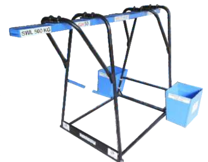
Gantry System With Ballast Box