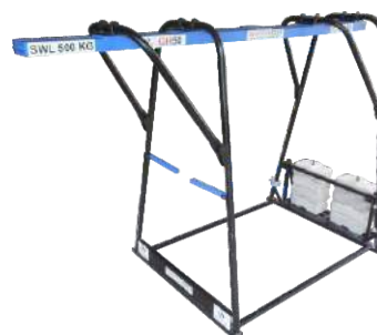
Gantry System With Counter Weight Frame