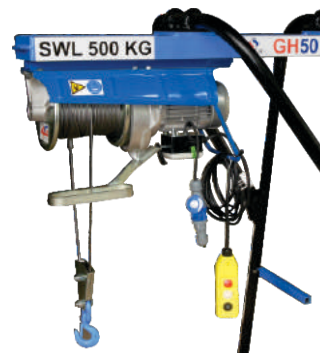
Winch System For Hoist

It can be compared with the famous brand product in the world.