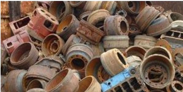
Plate & Structural Steel

Unpainted, new production scrap smaller than 12" and nothing coated on.