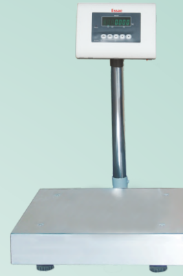
400 x 400 mm