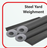
Steel Yard Weighment