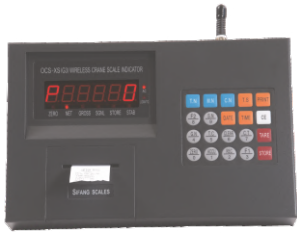
Wireless Remote Indicator with Printer (Option)