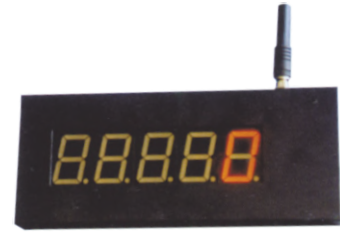
Wireless Remote Display (Option)