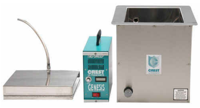
Tank, Genesis generator and immersible transducers.

Cavitation provides an intense scrubbing action that leads to unsurpassed cleaning speed and consistency when compared with simple soaking or immersion with agitation. Additionally, the minute bubbles formed penetrate even microscopic crevices, cleaning them thoroughly and consistently. As a result, ultrasonic cleaning is one of the most highly effective and efficient methods for cleaning a wide array of parts, even in mass-production environments.