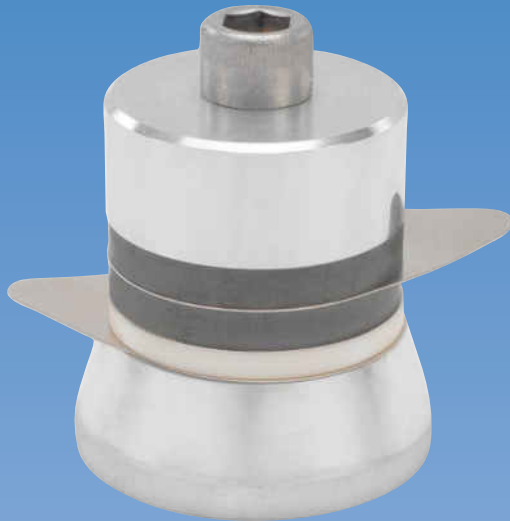
Patented Ceramically Enhanced Transducers

Crest's Powersonic™ rugged industrial strength performance gives you consistent quality at a benchtop price.