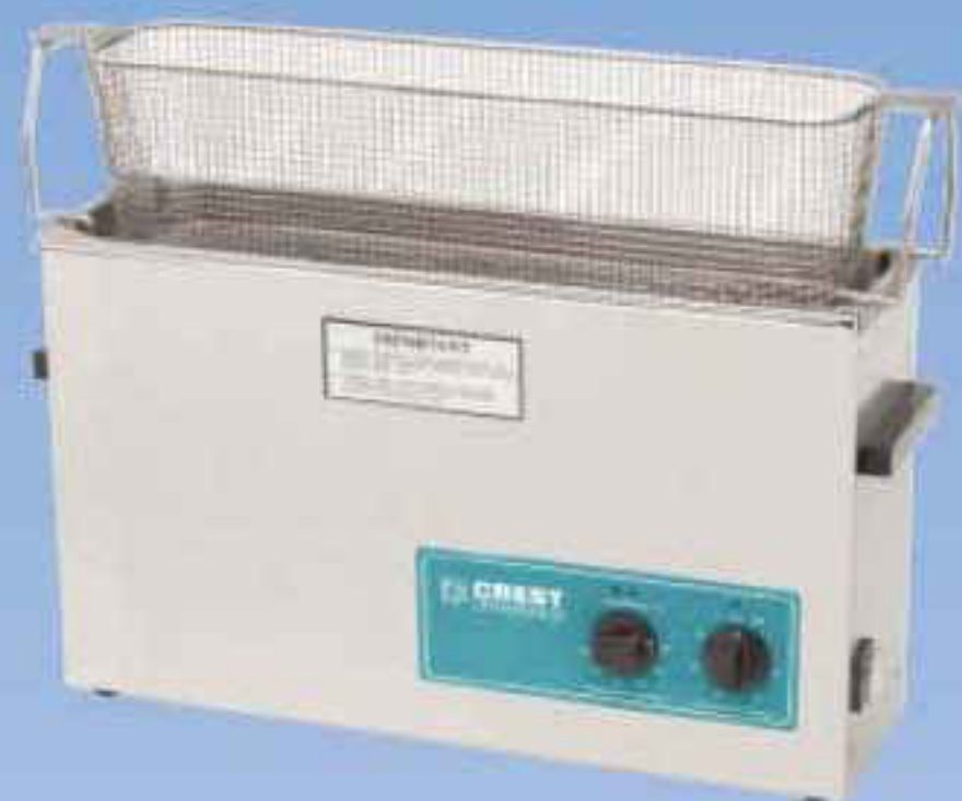
CP 1200 HT with SSMB 1200-DH Mesh Basket with Drain Positioning Handles

* Digital controls not available with CP 200 model