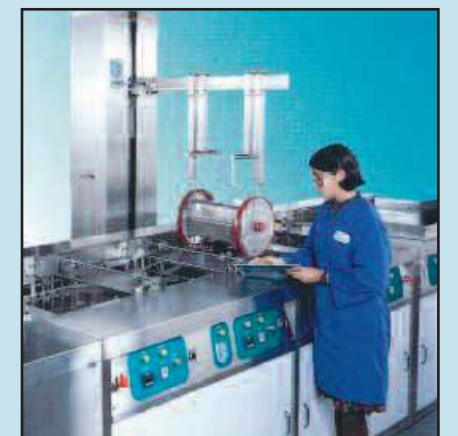
Optimum Console with Rigibot CTS-1000 Transport and RoTumbler Rotating Basket System.