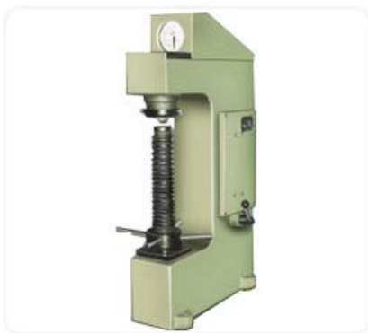
RAB - 250