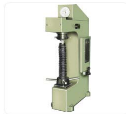
RAB - TWIN