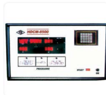
HDCM- 8500 Panel