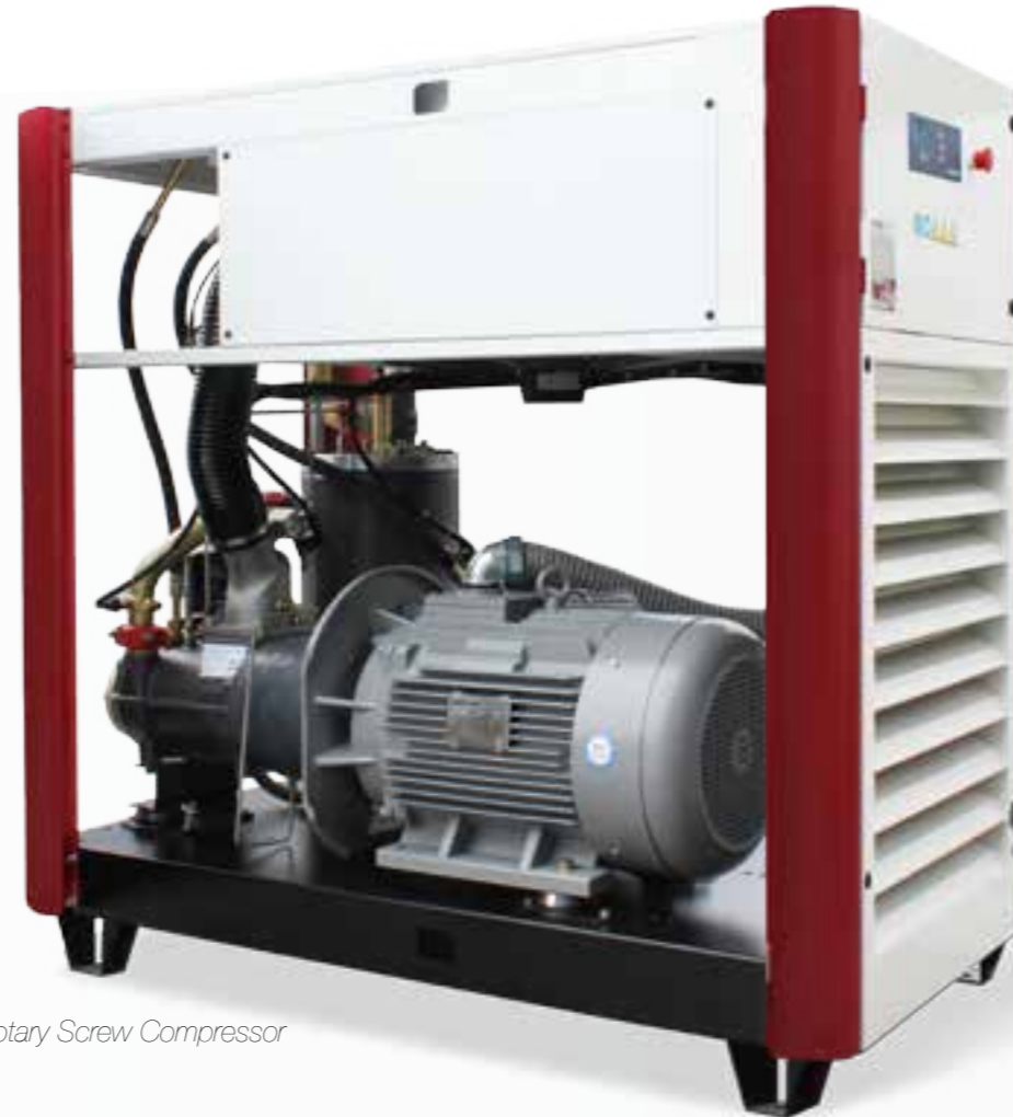
LB30 Rotary Screw Compressor

With direct or gear drive coupling, the belt free drive LB Series compressor range not only reduces transmission losses, it improves efficiency and reduces noise. Most importantly, it delivers greater reliability and reduced maintenance costs.