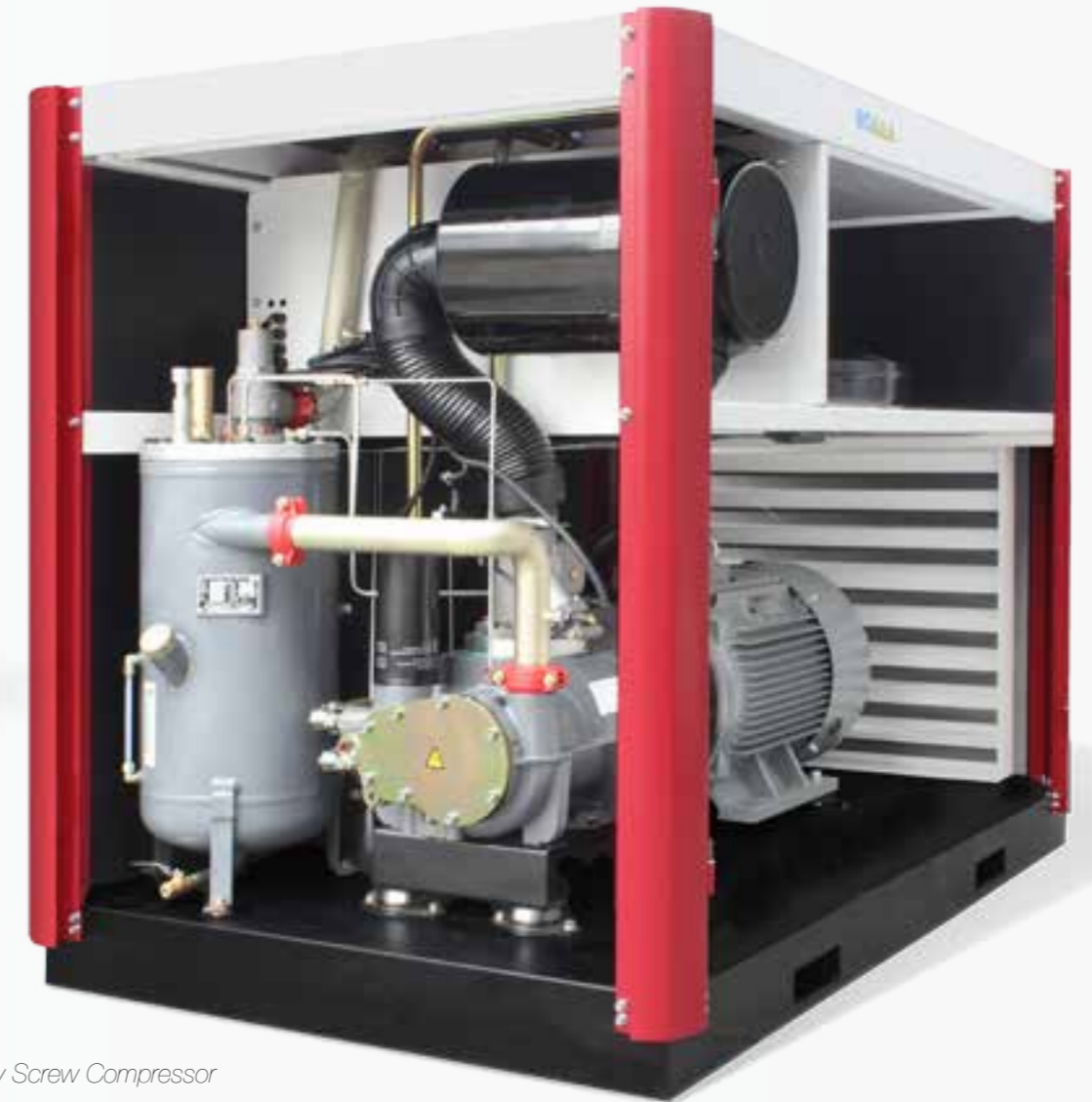
LB90 Rotary Screw Compressor

An inlet filter with an efficiency rating of 99% is standard equipment on the LB Series compressor range.