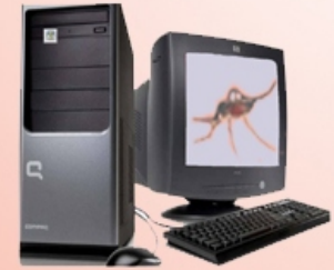
Model No.: ZSBM-T (Trinocular To Fix CCD Camera, Computer & Printer