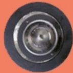
Dark Field Attachment