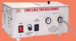
Fibre Optic Cold Light Illumination