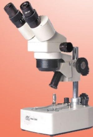
Model No.: ZSBM