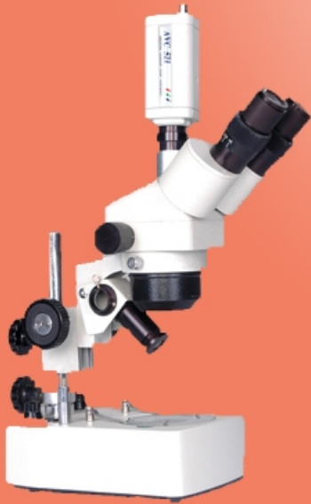
Model No.: ZSBM-T

Model : ZSBM & ZSBM-T (Trinocular To Fix CCD Camera, Computer & Printer