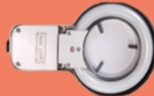
Ring Lamp (Fluorescence)