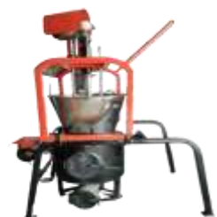
Biomass based Automatic Mawa-Machine