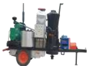
Portable Biomass Gasifier