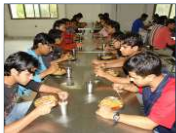
At Mess & Canteen