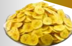
Banana Chips Manufacturers