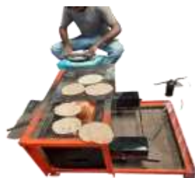
Roti Maker Biomass Stove