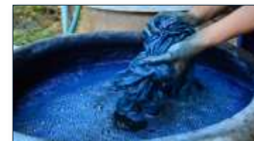
Fabric Dye Shops