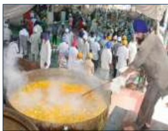
To Prepare Langar at Gurdwara