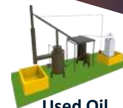
Used Oil Recycling Plant