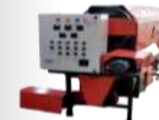
Biomass Torrefaction Plant (Charcoal Plant)