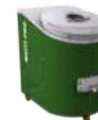
Multi-Purpose Food Processing Machine