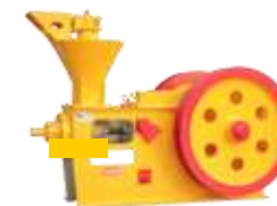
Biomass Briquette Pellet Machine