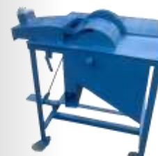
Wood Cutter / Biomass Shredder