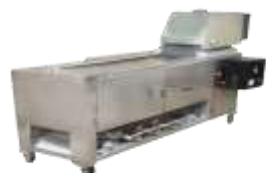
Automaking Roti Making Machine