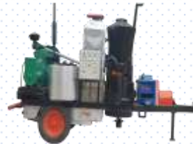
Portable Biomass Gasifier