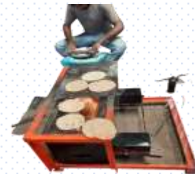
Roti Maker Biomass Stove