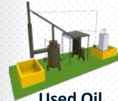
Used Oil Recycling Plant