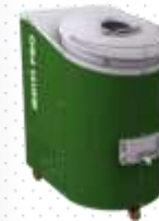
Multi-Purpose Food Processing Machine