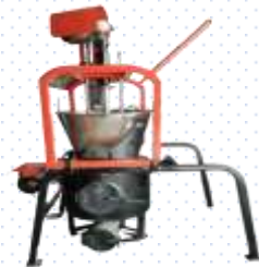
Biomass based Automatic Mawa-Machine