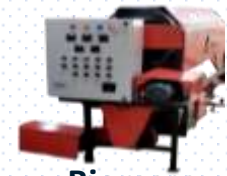
Biomass Torrefaction Plant (Charcoal Plant)