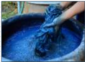
Fabric Dye Shops