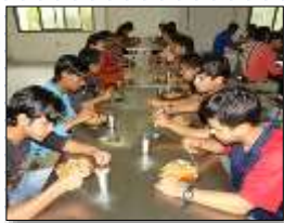
At Mess & Canteen