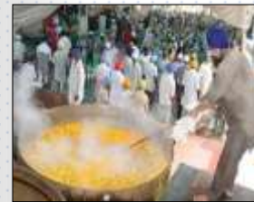
To Prepare Langar at Gurdwara