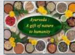
Ayurvedic Medicine Shops