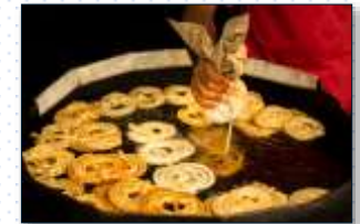
At Jalebi Shops