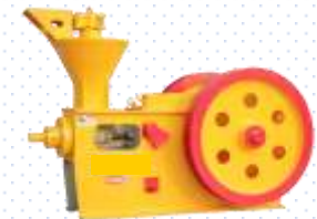
Biomass Briquette Pellet Machine