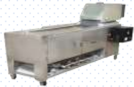
Automaking Roti Making Machine