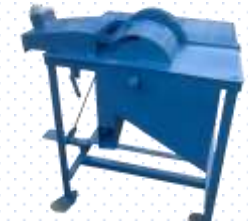
Wood Cutter / Biomass Shredder