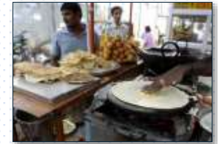
At Street Food Stalls