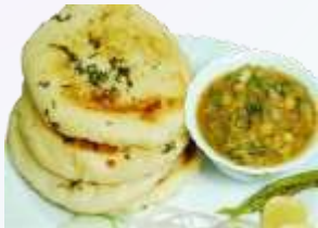
At Chhole-Kulcha Stall