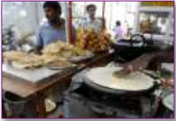
At Street Food Stalls