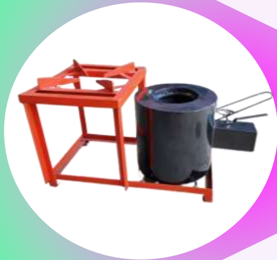
12" SMOKELESS BIOMASS STOVE/BHATTI