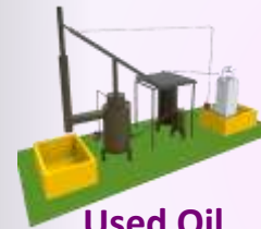
Used Oil Recycling Plant