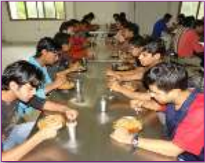
At Mess & Canteen