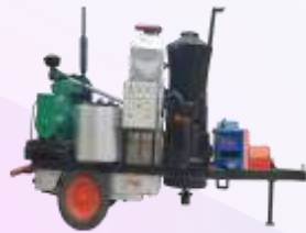
Portable Biomass Gasifier