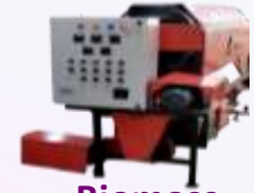
Biomass Torrefaction Plant (Charcoal Plant)