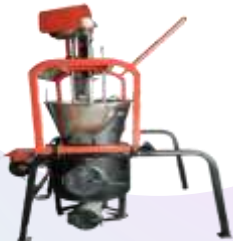
Biomass based Automatic Mawa-Machine