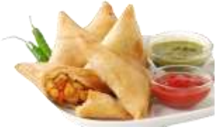
At Samosa Stall