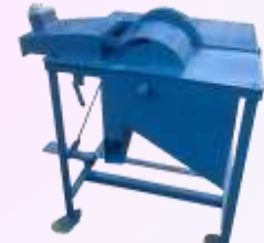
Wood Cutter / Biomass Shredder