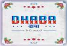
At Hotel & Dhaba