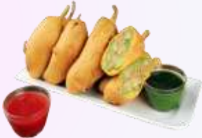
At Pakora & Snack shops