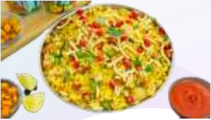
At Poha Stalls