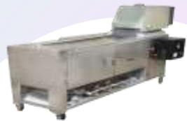
Automaking Roti Making Machine