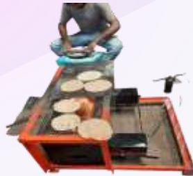
Roti Maker Biomass Stove