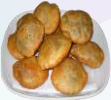
At Kachori Stall