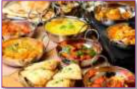
Prepare Food for 50-60 People