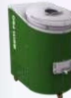
Multi-Purpose Food Processing Machine