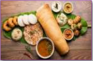
At Idli-Dosa Stalls