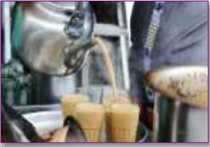
At Tea & Coffee Stall