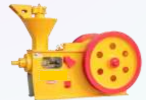
Biomass Briquette Pellet Machine