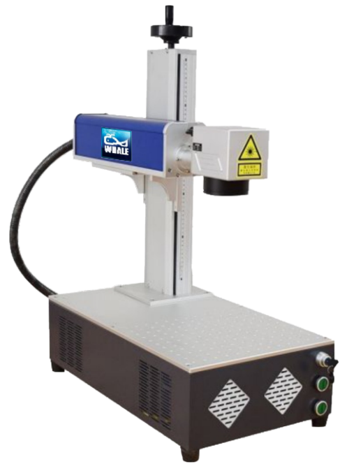
Portable Fiber Laser Marking Machine