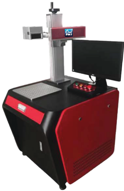
Standard Fiber Laser Marking Machine