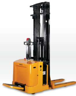
Electric Pallet Trucks