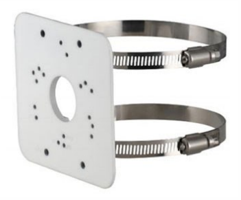
CP-UA-B2P Pole Mount