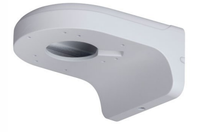
CP-UA-B06DW Wall Mount