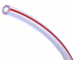
Single Milk Tube (Ø14 X Ø24) Transperent Red Line