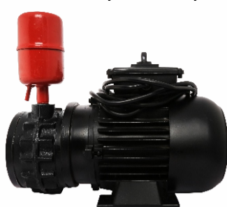
Vacuum Pump Oil 240 LPM (220V-50Hz)