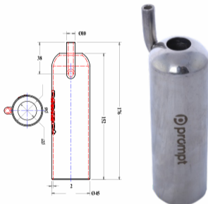
Teat Cup (SS-304)