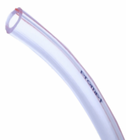
Short Vacuum Tube (Transperent)