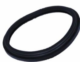
Gasket Vacuum Tank Lid