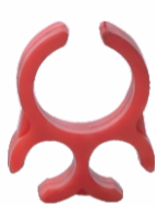
Tube Clip - Red (Prompt)