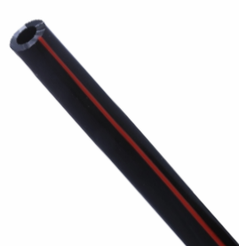
Single Milk Tube (Ø14 X Ø24) Black Red Line