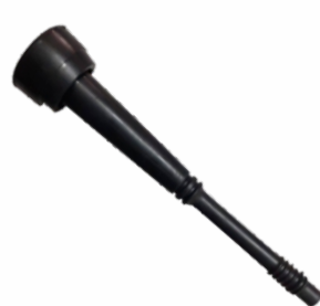
Liner - (3109)