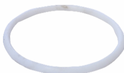
Gasket Of 25 Ltr Can Lid