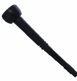
Liner -Milkrite (MS390u) Ø24-Ø9