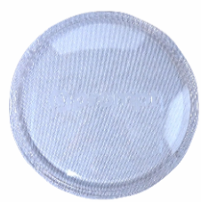
Vacuum Tank Lid