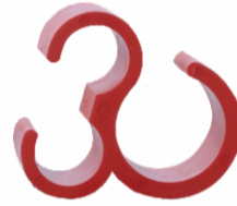
Tube Clip (S-Type) Red