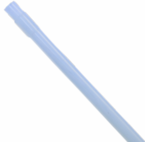
Short Vacuum Tube (Silicone)