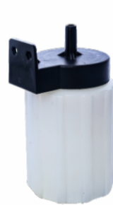
Waste Oil Tank