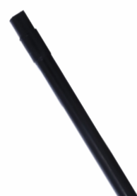
Short Vacuum Tube