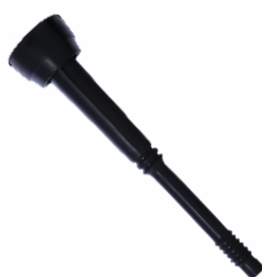
Long Liner (024-8)