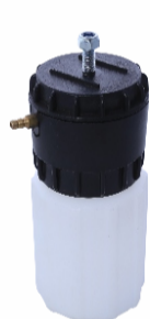
Lubricator - 0.5 Ltr