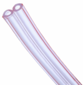
Twin Pulse Tube (Ø7 X Ø14) Transperent Red Line