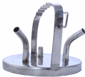
25 Ltr Can Lid (SS-304)