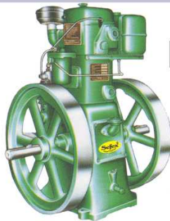
5 HP to 6 HP Vertical, Single Cylinder, Water Cooled, Slow Speed Diesel Engines Tapper Roller Bearing (TRB) and Bush Bearing (BB) type.