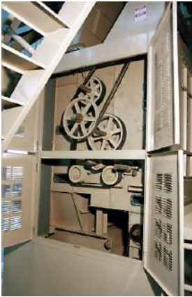
Doors open right side.