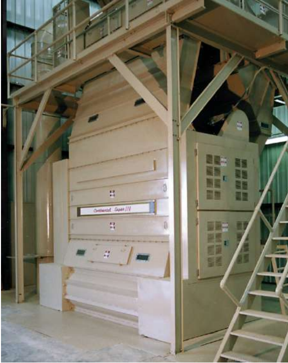
Inclined Cleaner over the Super III Stick machine with a 36" vacuum.