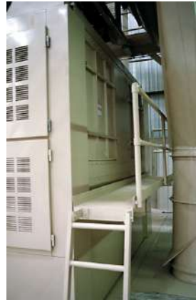
Wide rear access doors and catwalk.