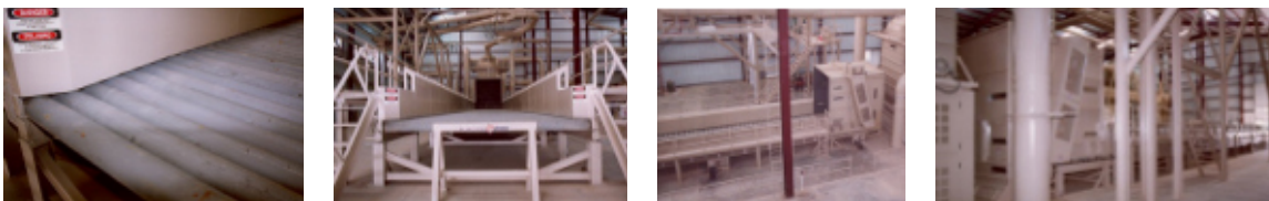
Module Feeder shown with full length walkways and side walls.

The Bajaj Module Feeder controls the volume of seed cotton conveyed dispersed and fed into the gin and is limited only by the maximum seed cotton feeding capacity of the gin machinery.