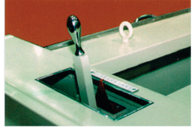
Variable set ote opening control

The amount of trash removed is controlled by the size of the adjustable mote opening. This opening can be adjusted during operation by a handwheel on