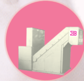
6 Cylinder Lint Cleaner