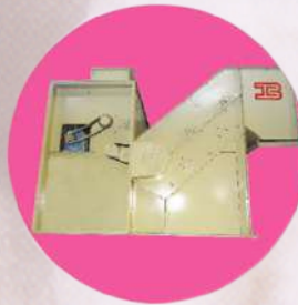
With Separate Drive Feeder Roll