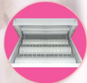
With One Nail Opener Roll and Capsule Jali for Better Trash Separation