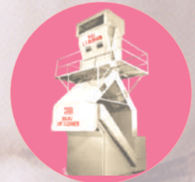
With Air Separator & Bypass

“Quality is never an accident. It is the result of an intelligent effort. There must be a will to produce a superior thing.