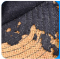
Damage of textile

It protects your export products from various damages caused by moisture as shown below: