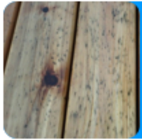
Mould & Mildew on wooden products