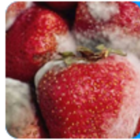
Mould & Dprouting on agricultural product