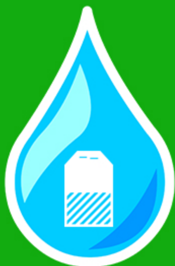
Small Package Desiccant

OUR PRODUCT PROTECTS & PRESERVES YOUR CARGO