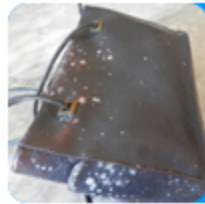
Mould & Mildew on leather products