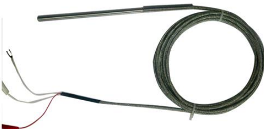
RTD with High Temperature Cable