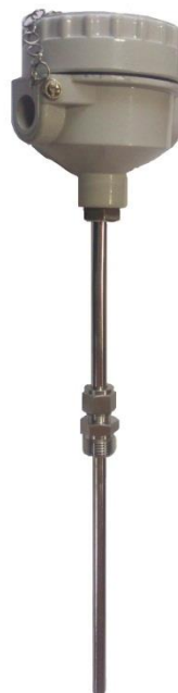
Thermocouple with Flameproof Terminal Housing & Ferrule type Process connection