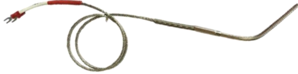
Thermocouple - Mineral Insulated with Flying Leads