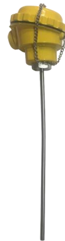
K type Thermocouple with push type mounting and Aluminium Terminal Housing