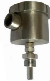
RTD with SS Terminal Housing