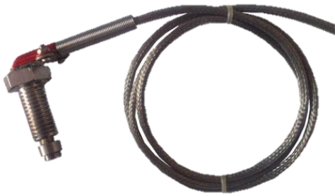
RTD with spring loaded arrangement