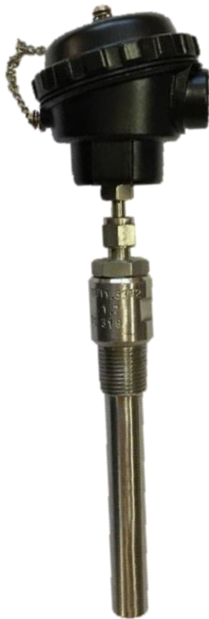
RTD with Adjustable Ferrule nut Connection with Thermo-well