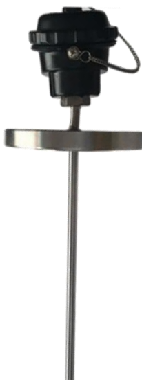
Thermocouple with Aluminium Terminal Housing & Flange Process connection