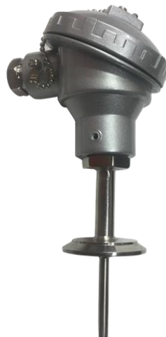
RTD with TC connection with Miniature Aluminium Terminal Housing