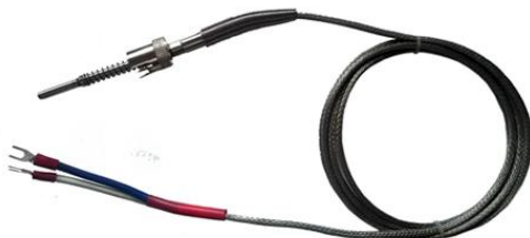
Thermocouple with SS braided cable for high temperature and Bionet type connector