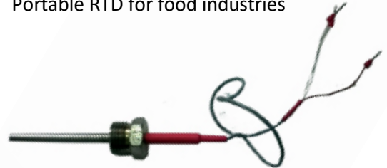
Miniature RTD with Flying Leads