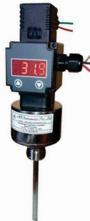
RTD with DIN type Indicator with Transmitter & PNP (To be mounted on 4 pin connector)