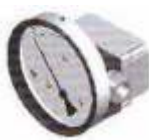
Gauge + Switch (With terminal strip inside)