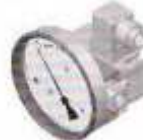
Gauge + Switch (With DIN plug on top)