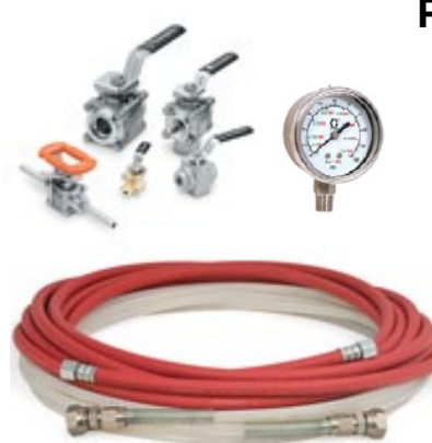
Hose, Valves, Fittings